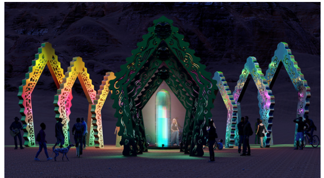
Ground level view by night