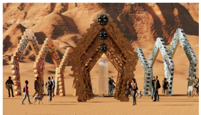
Ground level view by day